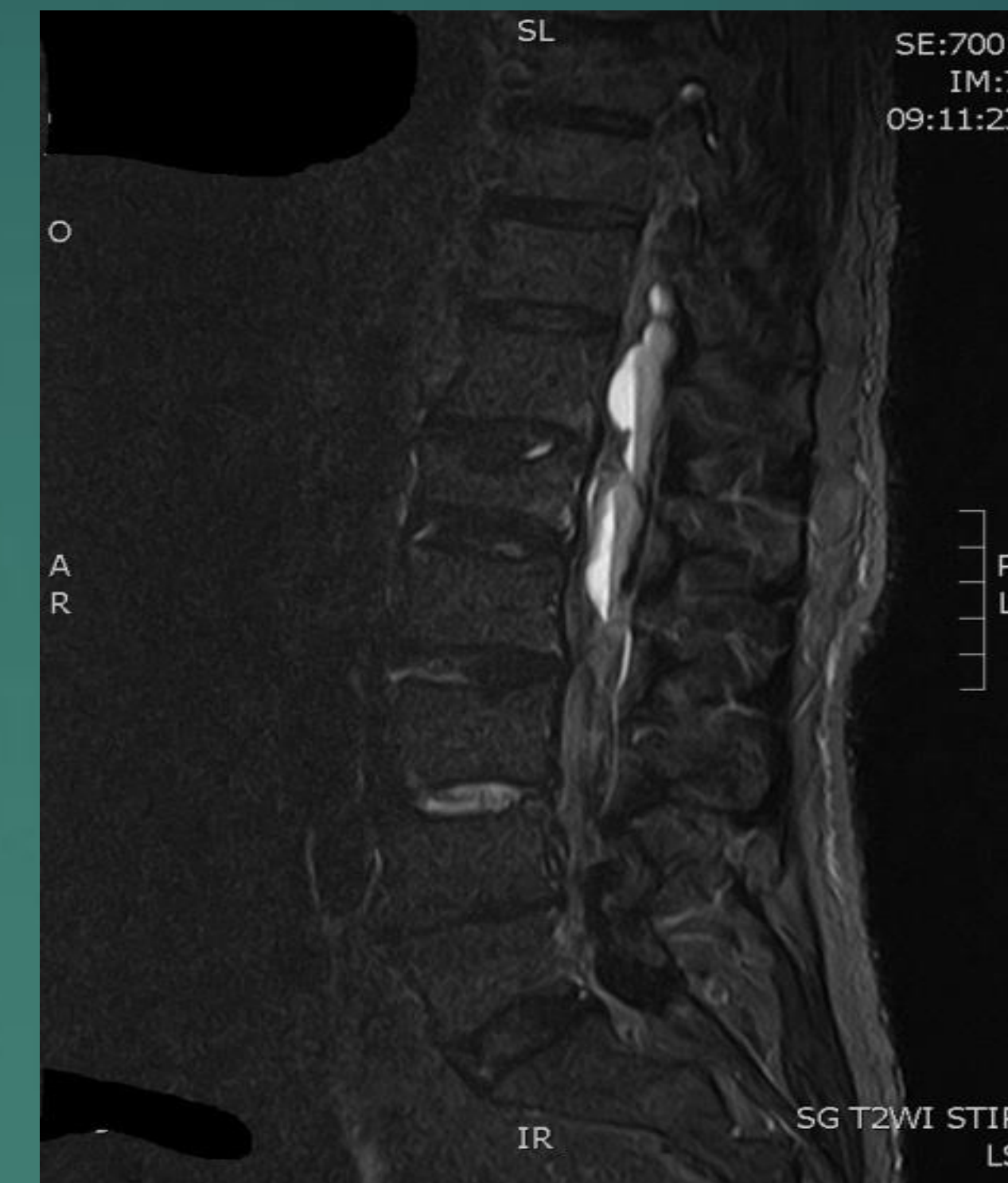
b) Sagittal STIR image showing hyperintense subdural hematoma

The differential diagnosis includes abscess, lipomatosis, significant discal hernia and tumors..