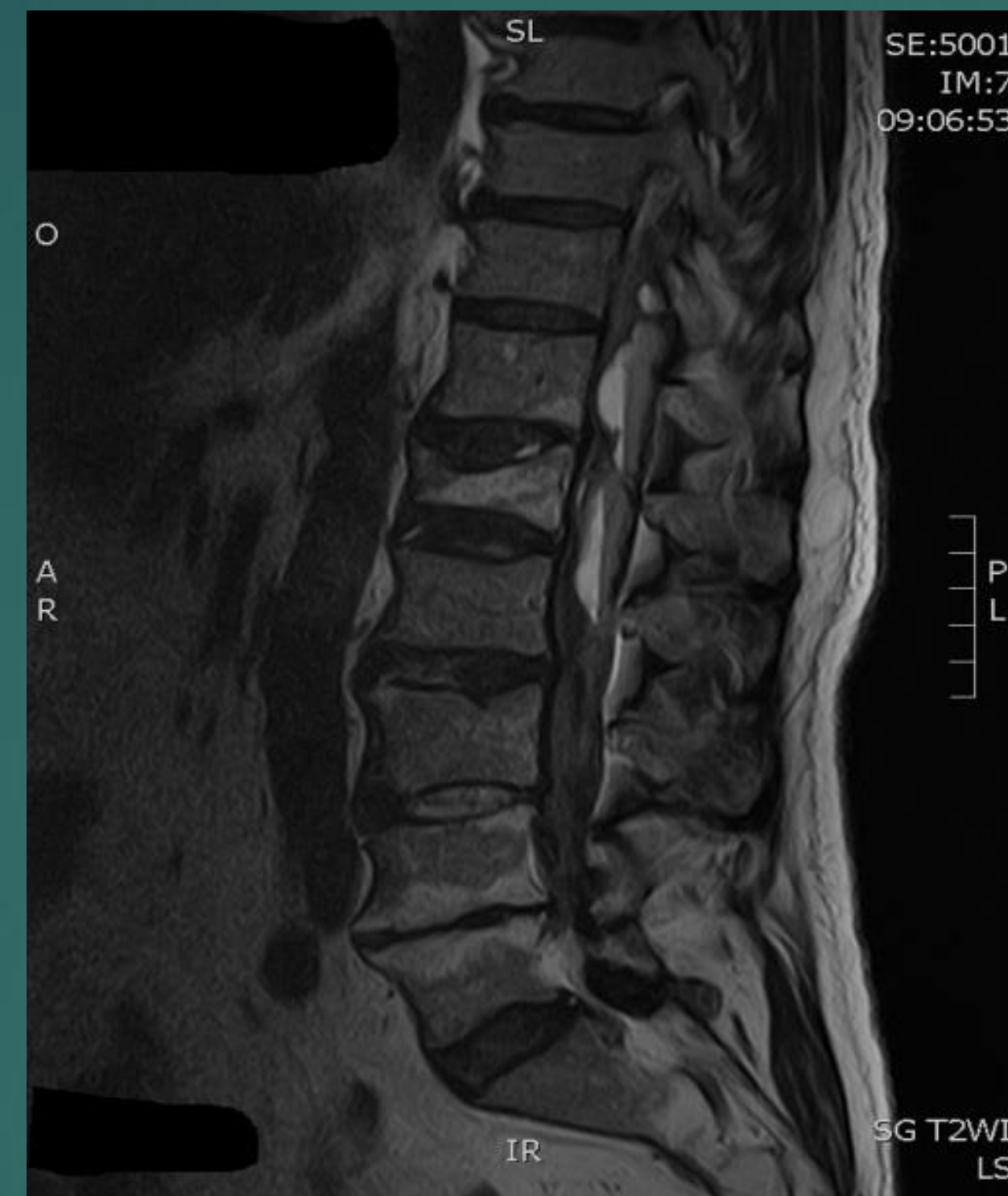
a) Sagittal T2W image showing Th12-L2 hyperintense subdural hematoma

Symptoms can vary according to the level of the bleed causing back pain with a radicular component, weakness and complete paraplegia.