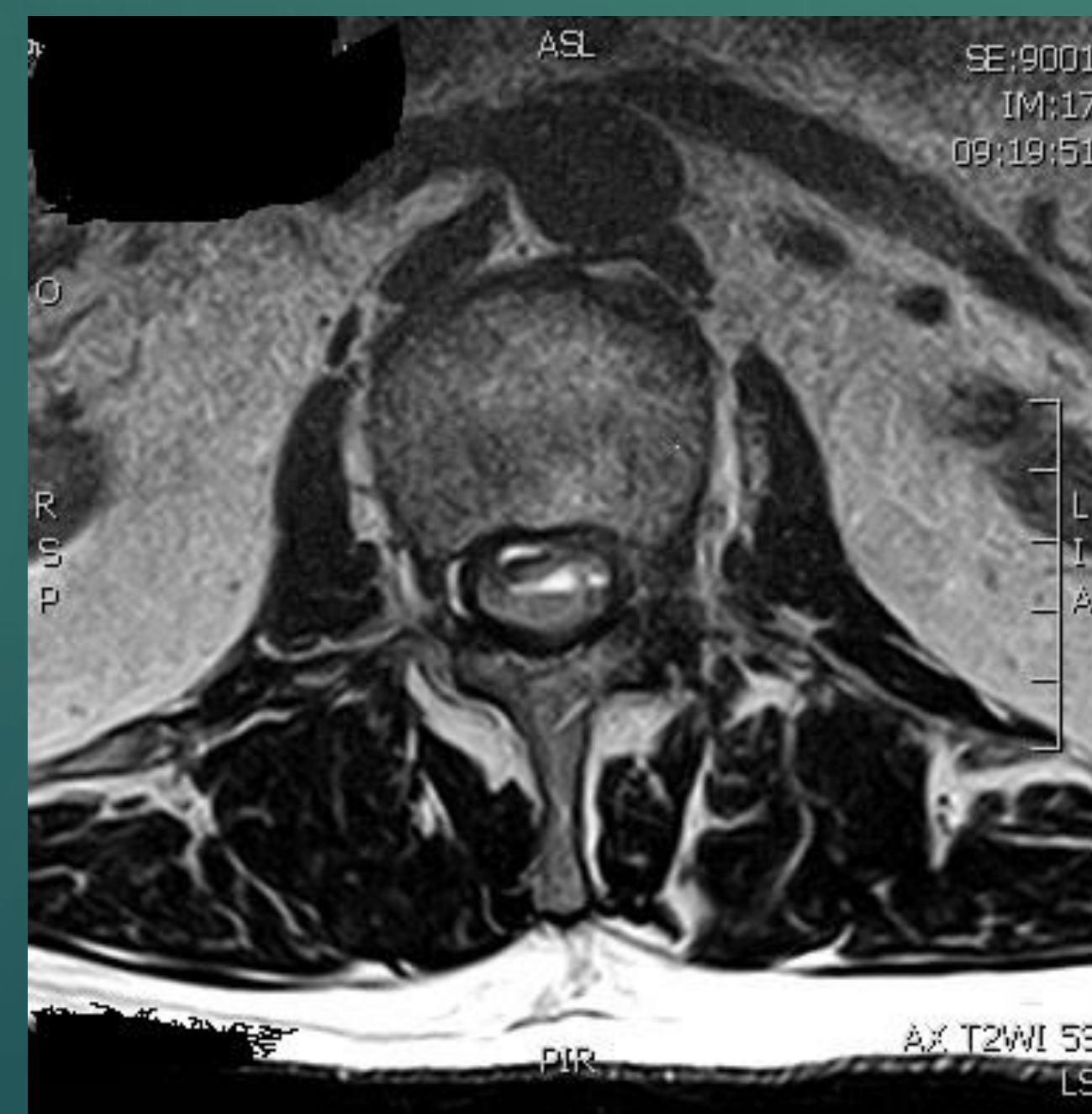
c) Axial T2W showing the "Y" shaped sign of the SDH at the level of L1

Treatment involves conservative management in cases with preserved neurology or laminectomy and drainage in cases with serious neurological deficit